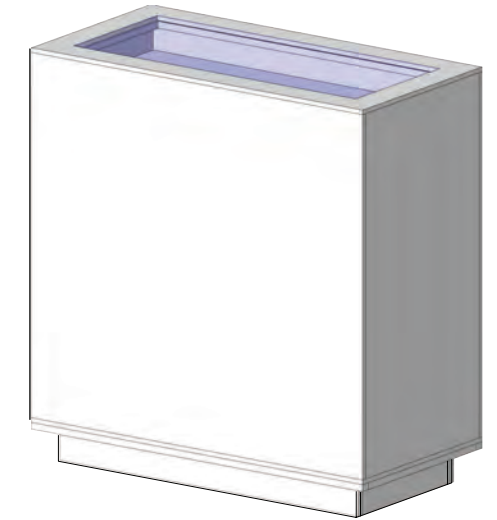
Completed Front View