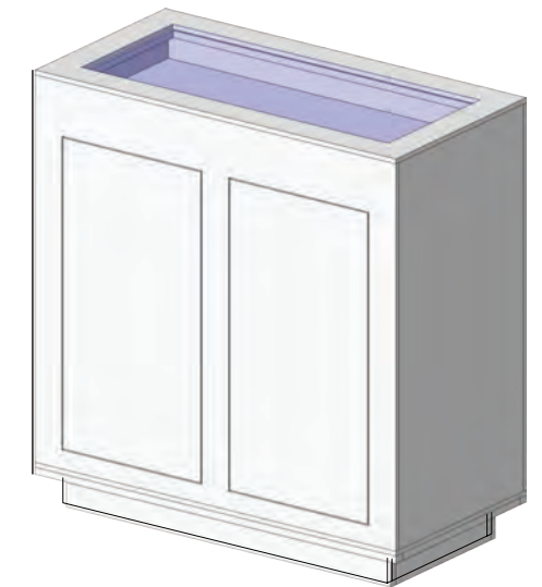
Completed Back View